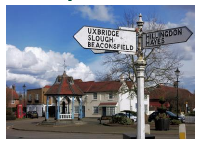
Ickenham Village Pump