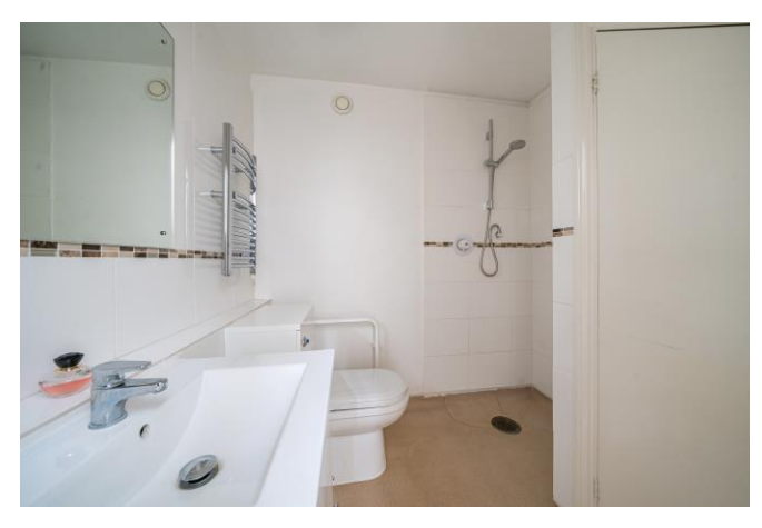
Bedroom 1 Bedroom 2 Shower room