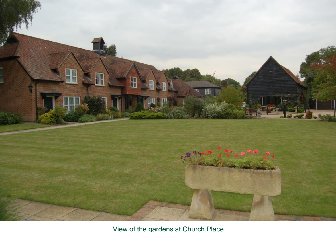
View of the gardens at Church Place