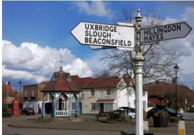
Ickenham Village Pump