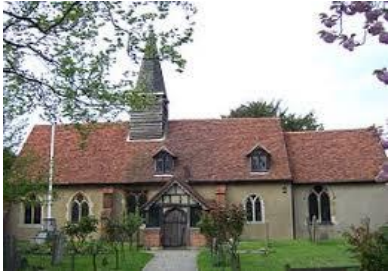
St Giles' Church