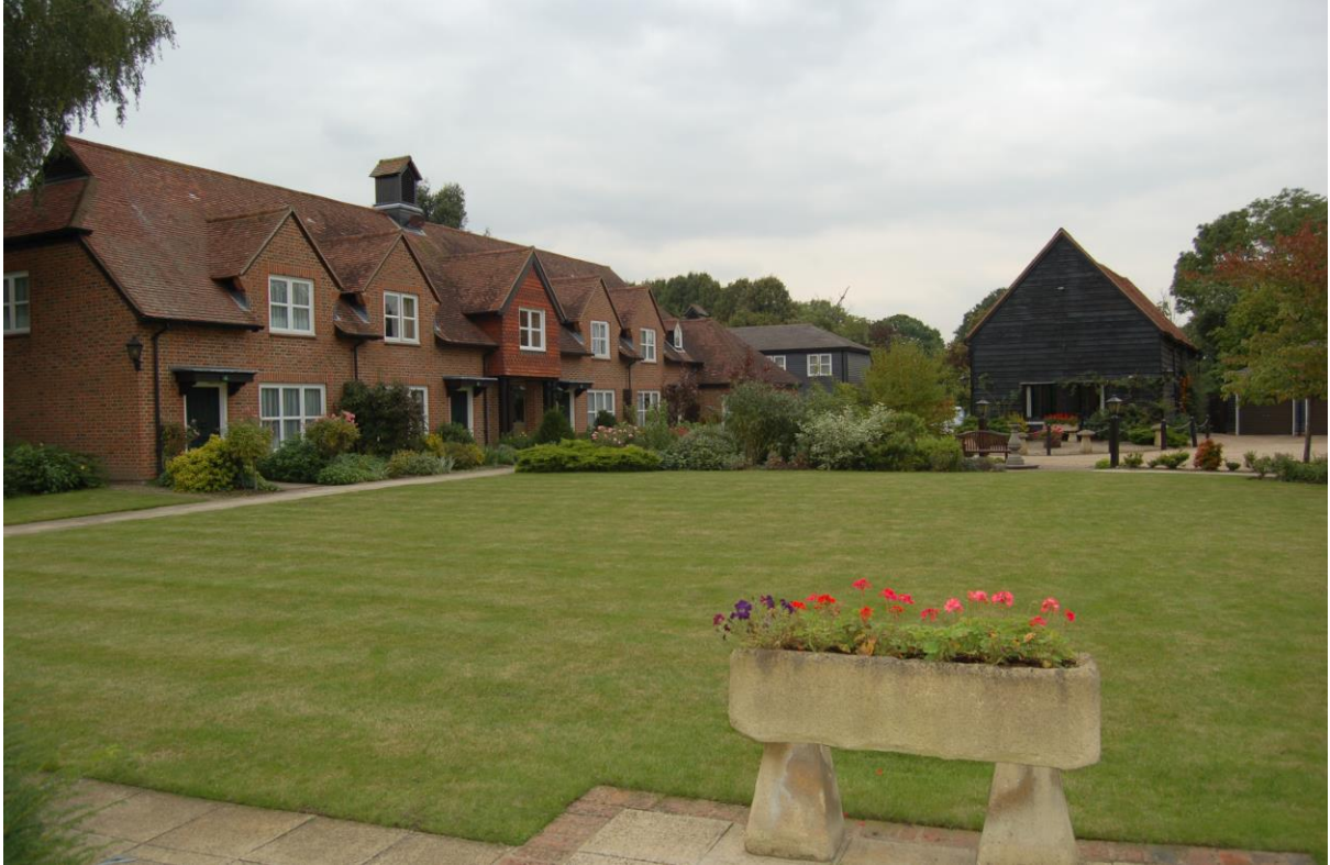
View of the gardens at Church Place