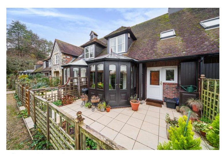
Rear with garden

Approximate Gross Internals: 109.9 m<sup>2</sup> / 1184ft<sup>2</sup> Service Charge: £7992 pa Energy Performance Rating: D Council Tax Band: G