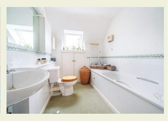
Bedroom 1 Bedroom 2 Bathroom