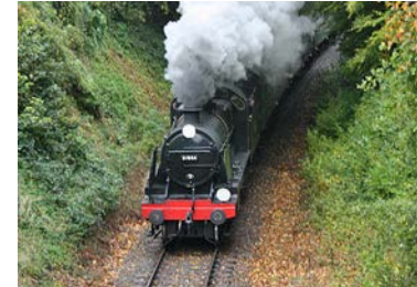
The Watercress Line