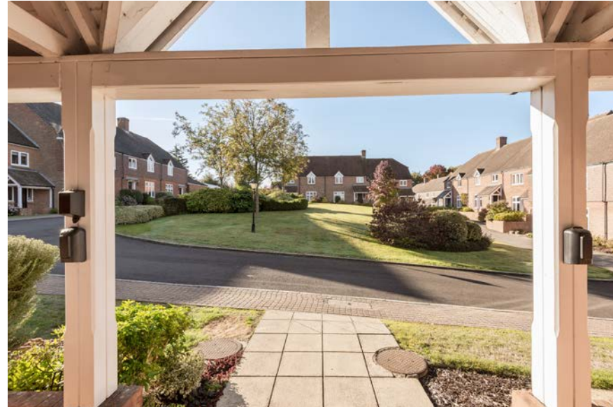
View to the front of the property

Approximate gross internals: 82.4 m 2 / 887 ft 2 Condition Code: B