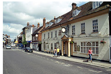
Alton High Street