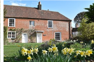
Jane Austen's House

Cognatum Property Limited, Pipe House, Lupton Road, Wallingford, Oxfordshire OX10 9BS