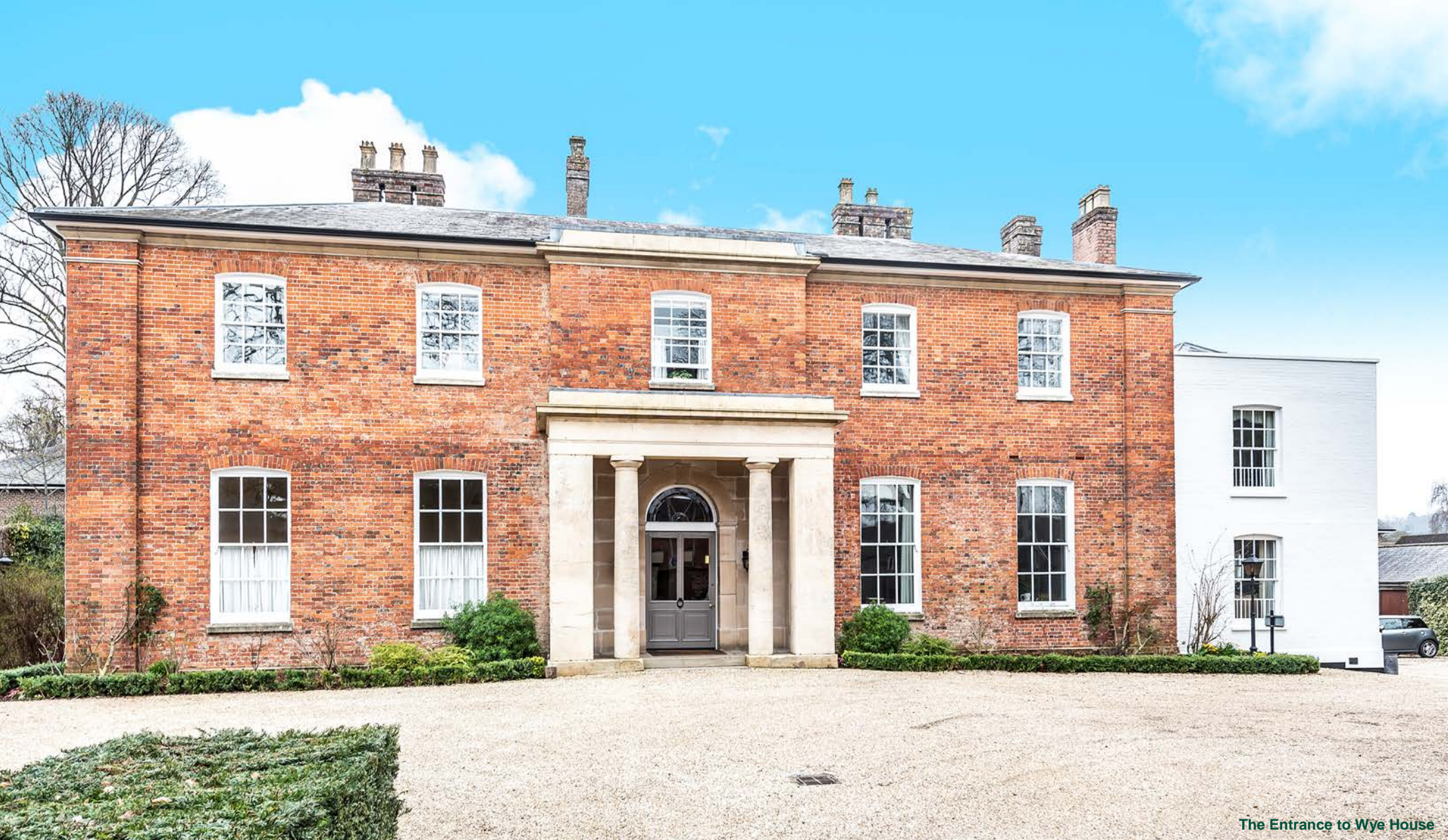
The Entrance to Wye House