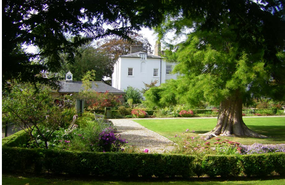
The Central Courtyard Gardens at Wye House