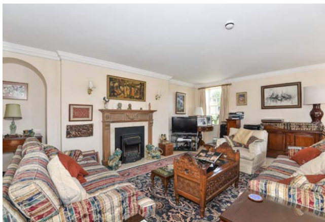
Sitting / Dining Room