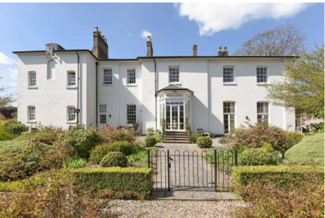
Rear of Wye House (no. 5 on the left)