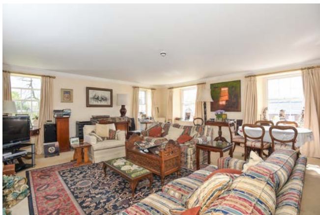
Sitting / Dining Room

For viewings please call the Estate Manager 01672 519923