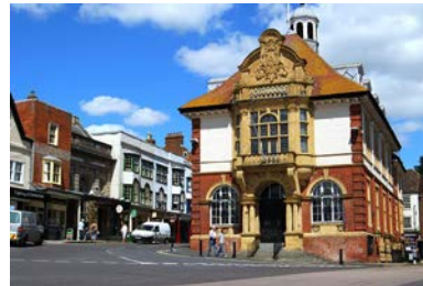
Marlborough Town Hall