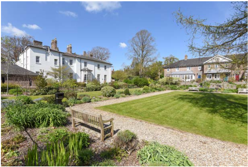
The Central Courtyard Gardens

Approximate gross internals: 161m 2 / 1734ft 2 Condition Code: D Energy Performance Rating: E Council Tax Band: G