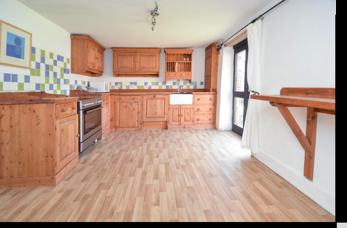
Our View "Deceptively spacious delightful barn conversion in village location"