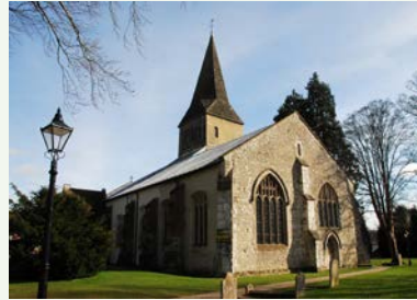
Church of St Lawrence