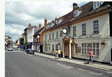
Alton High Street