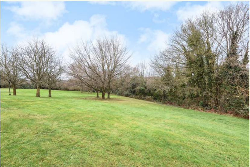
View from the property looking towards the Watercress Line.

Approximate gross internals: 113.5m 2 / 1222ft 2 Condition Code: D Energy Performance Rating: 52 (E) Council Tax Band: F