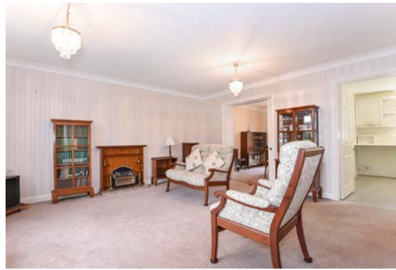
Sitting room through to dining room & kitchen