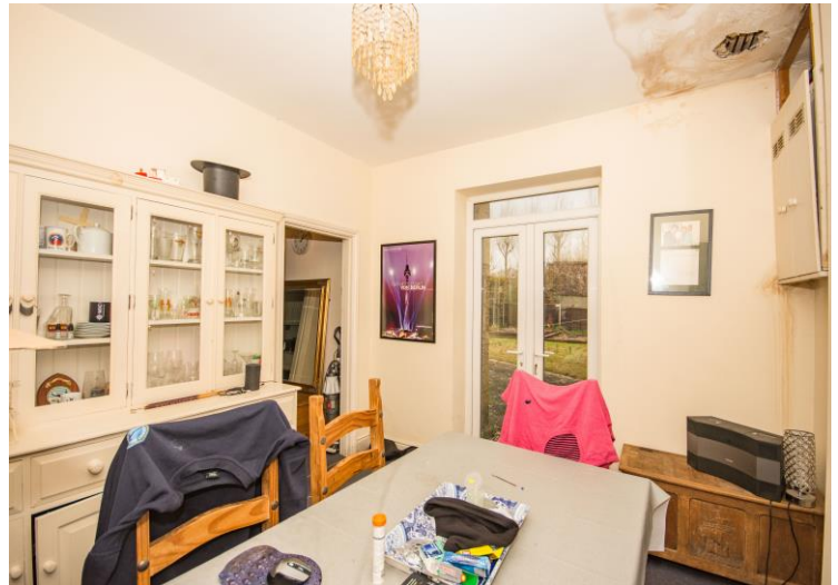
98 Kings Road West Swanage