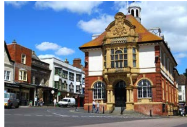
Marlborough Town Hall