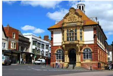
Marlborough Town Hall