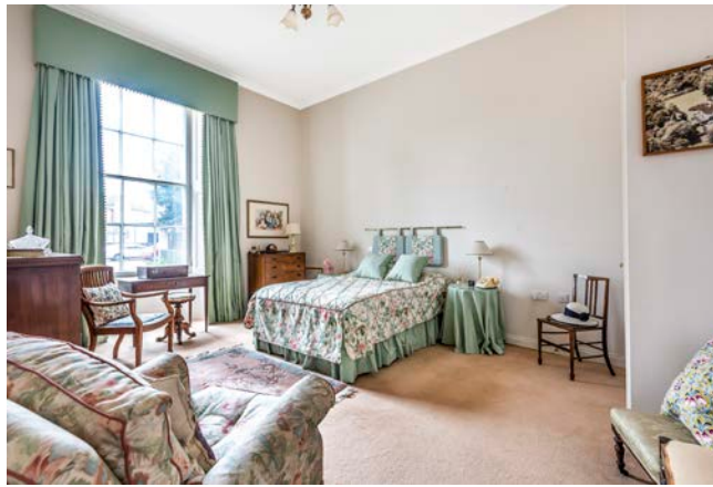
Bedroom 2 (Ground Floor)