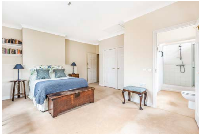
Master Bedroom and En-suite (1 st Floor)