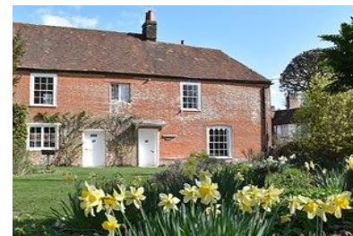
Jane Austen's House

Cognatum Property Limited, Pipe House, Lupton Road, Wallingford, Oxfordshire OX10 9BS