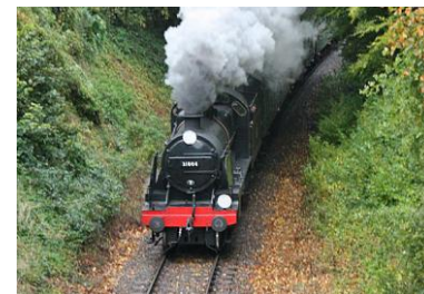
The Watercress Line