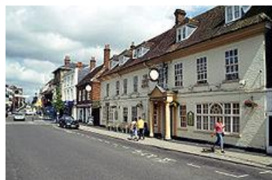
Alton High Street