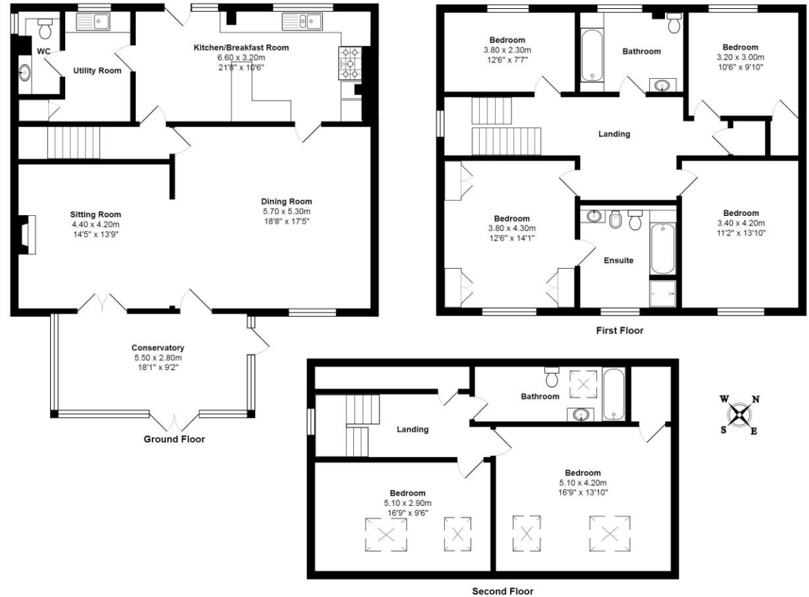
Ludgate House, Haytor Total Area: 255.3 m 2 ... 2748 ft 2